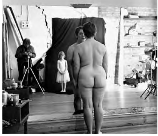
Top: Request Concert , 1990s Lower: Elegant , 1991 Opposite: That Girl Faced Stranger , 1990